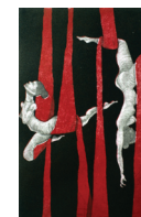
Britta Ambauen October