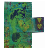
Kitty Melville September